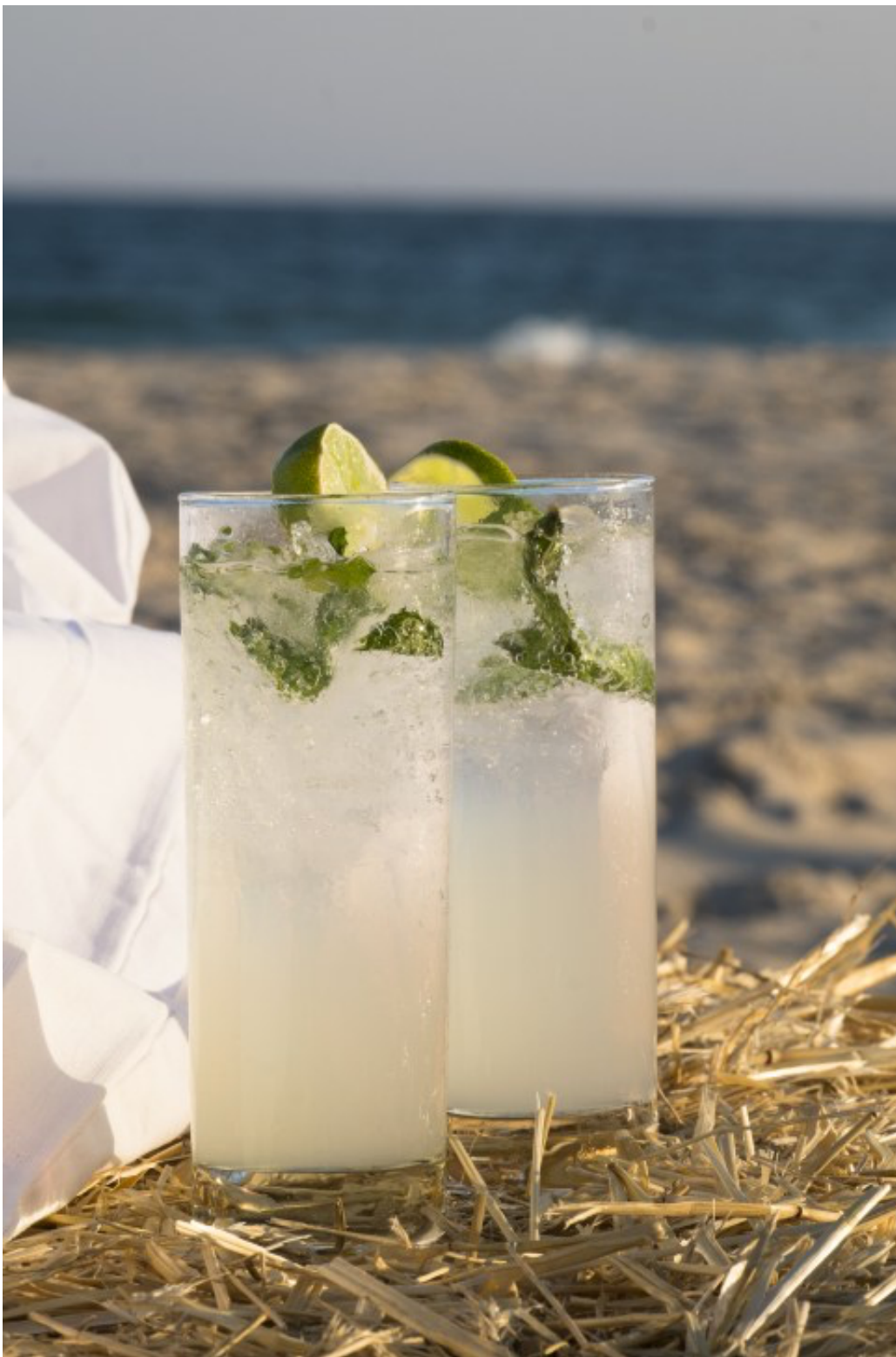
The Sebonack Southside is a Hamptons variation of the mojito.

A mojito walks into a bar in the Hamptons and you'll never guess what happens. It does what many Hamptonites do: kicks off its shoes and slips into a glam party dress.