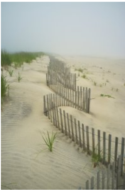
Tracing the dunes in Southampton.